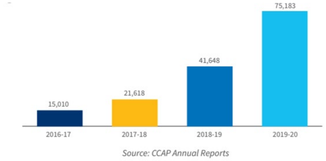
Figure 3: CCAP Dual Enrollment